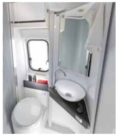
Duplex bathroom with swivel wall feature.