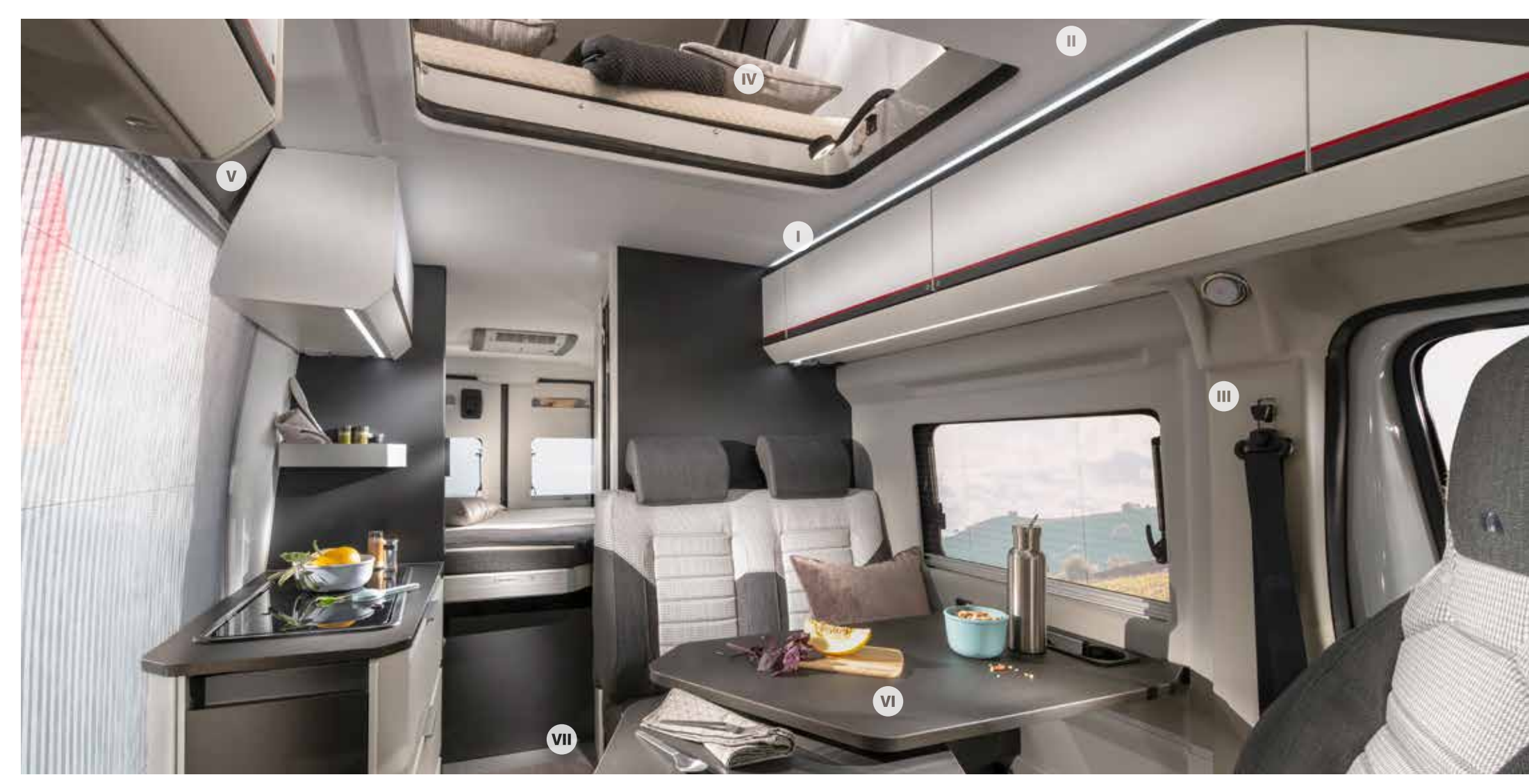
I. Contemporary interior design with smart lighting system.