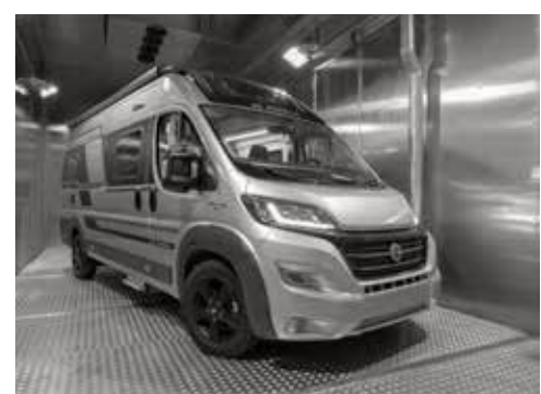
Adria Mobil new campervan manufacturing site, opened March 2022.