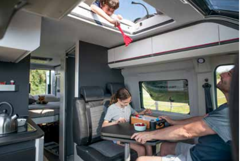
Large flexible dinette and kitchen with oven/grill, sink & large compressor fridge.