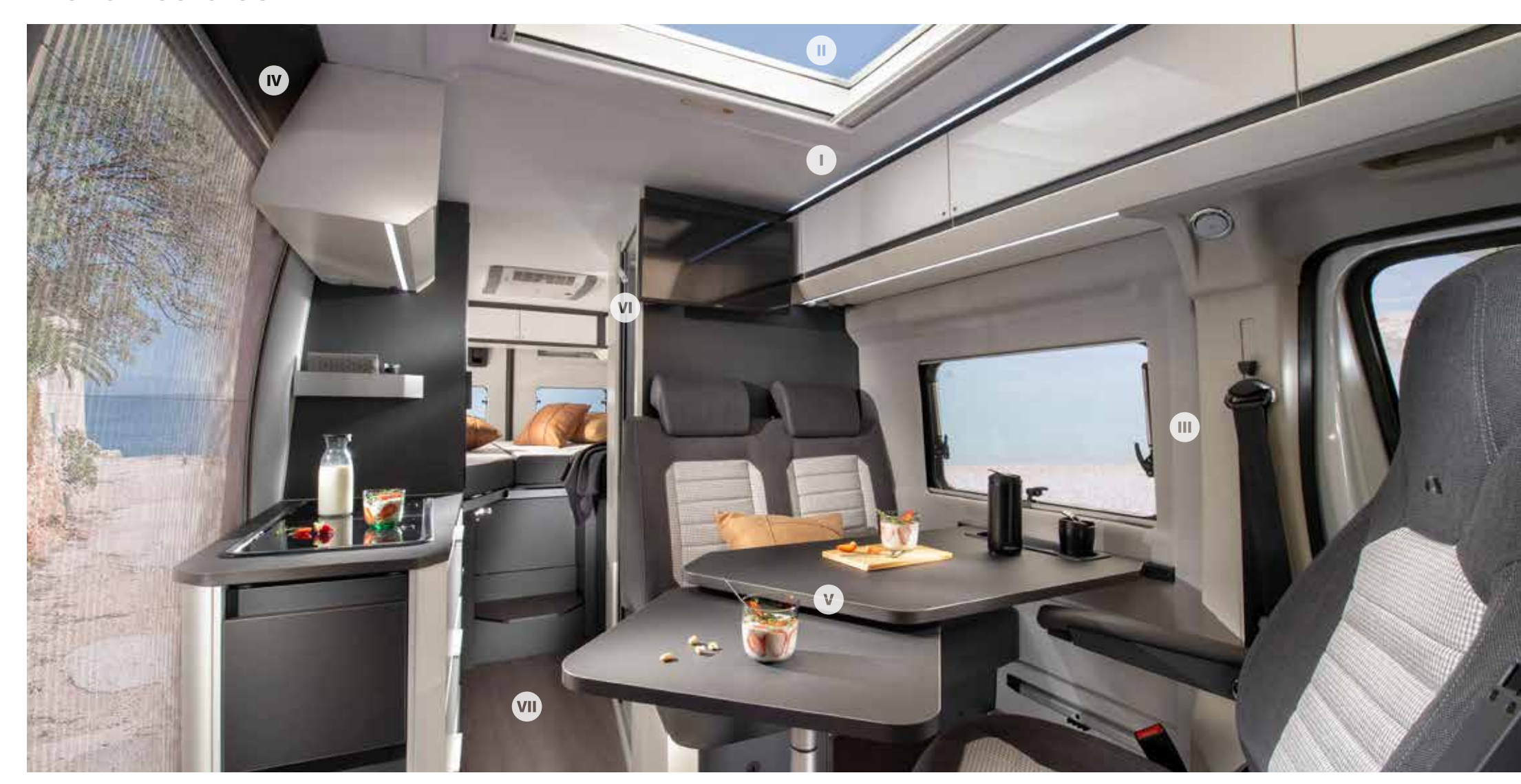
I. Contemporary interior design with smart lighting system.