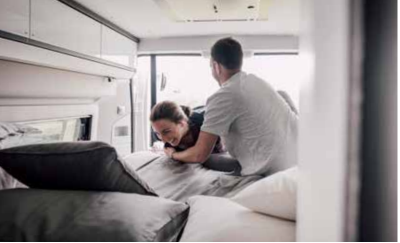
Comfortable rear bedroom with a choice of bed formats.