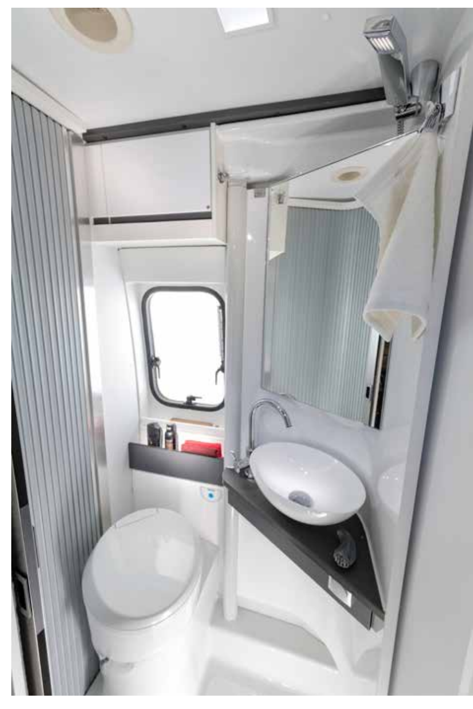
Compact, fixed bathroom for smaller layouts.