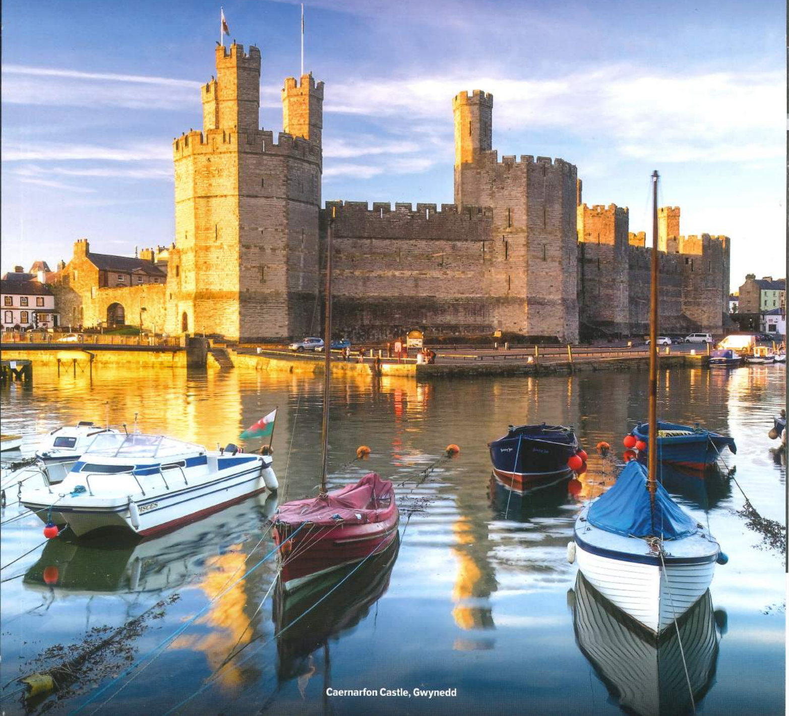
Caernarfon Castle, Gwynedd

Explore Caernarfon & Anglesey on a summer tour you won't forget Plus... Northumberland, Oxford, and 10 sites where you can learn a new skill!