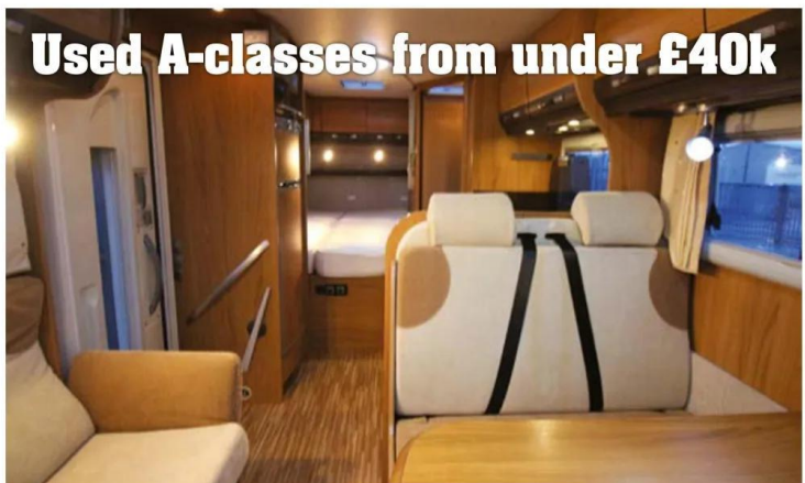
Used A-classes from under £40k