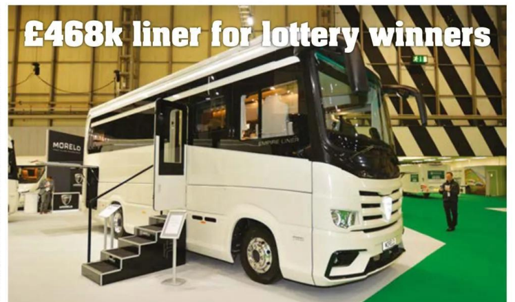
£468k liner for lottery winners