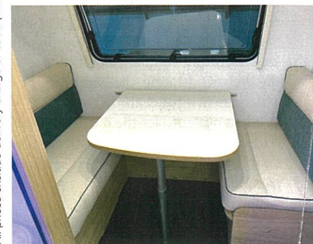
*All prices exclude delivery charge of £995 (including VAT)

The roomy lounge makes up into another bed. During the day, there's plenty of space here to relax and dine. The kitchen has an oven/grill, as well as a two-burner hob. The washroom is located just opposite the kitchen.