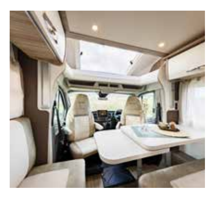
Wherever you plan to travel and whatever you plan to do, Tessoro provides the perfect home from home with functional storage facilities for all your holiday and hobby essentials.