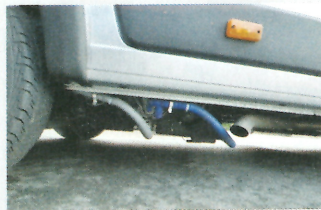
Water-tank drainpipes dangle and are close to the exhaust