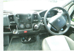
Production models will get padded steering wheel