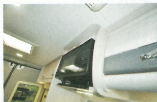
Auto-Sleepers has switched to Dometic microwaves