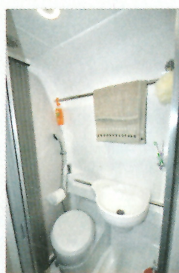
Tambour door saves space; handbasin slides over for more room when showering