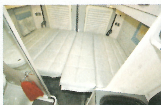
Rear bed could be left made up permanently if preferred