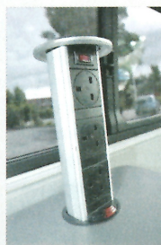
Handy pull-up mains socket tower in the kitchen