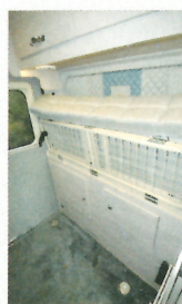
Seat/bed frames fold away to optimise storage space just inside the back doors

Elsewhere, details of note range from the LED paddle reading lights on a rail, to a good selection of mains and USB outlets throughout.