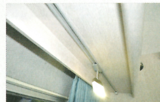
Paddle lamps on rails are practical and look smart