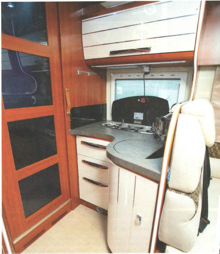
Clockwise from left: kitchen features three-ring hob and sink – the fridge-freezer and oven/grill tower are opposite; neat en-suite bathroom (shower is separate); big adjustable table for meal times