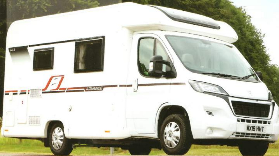
Bailey Advance 66-7 at Talepval, Somme, France