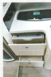
Although the kitchen is compact, it's well equipped