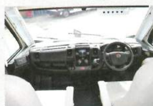
Fiat Ducato cab has cruise control and air conditioning

The shower only has one drainage hole. But it has six LEDs around the outside, and a proper door handle.