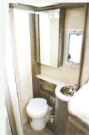
Washroom has a small handbasin and a large mirrored cupboard