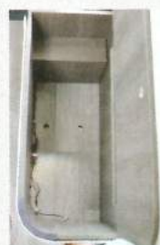
There's plenty of storage space, but watch your payload