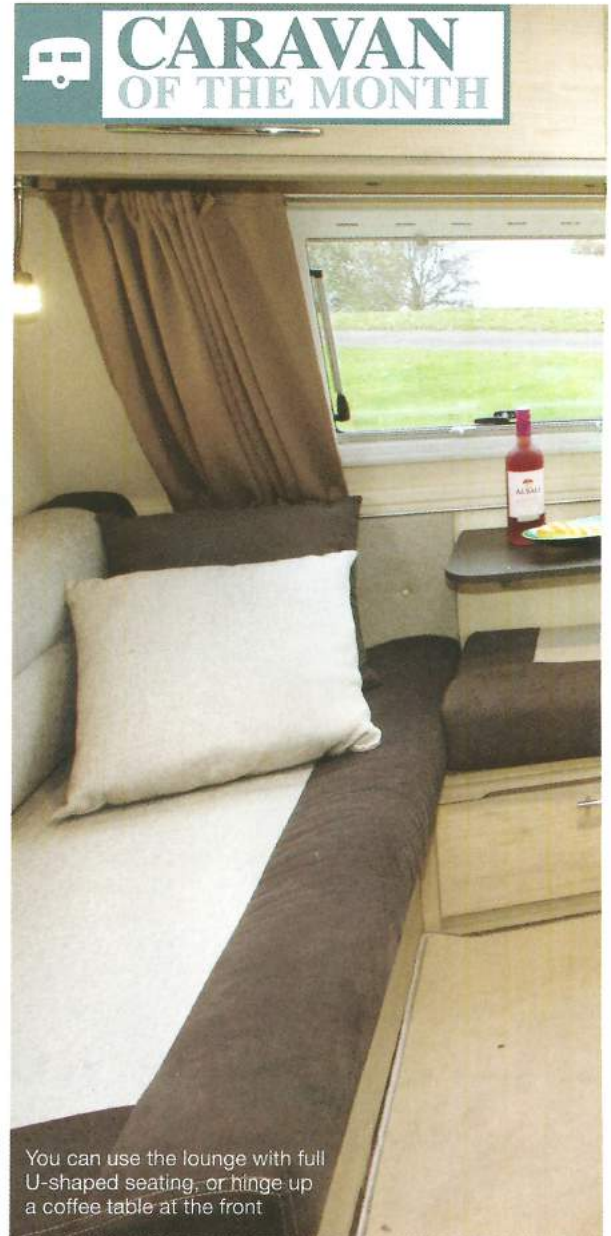
You can use the lounge with full U-shaped seating, or hinge up a coffee table at the front

The shower room, in particular, is very British in design, with the shower in the nearside, the loo on