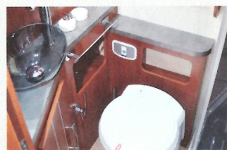
Washroom has a translucent handbasin and large mirror