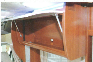
There are two unshelved overhead lockers up front