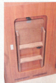
The small set of steps makes it easy to access the rear bed