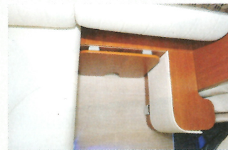
Folding this handy flap by the sofa provides leg-room