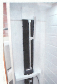
Shower cubicle is big and well lit, but only has one drainage hole