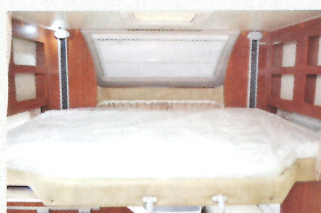
No need to remove headrests to lower the drop-down bed