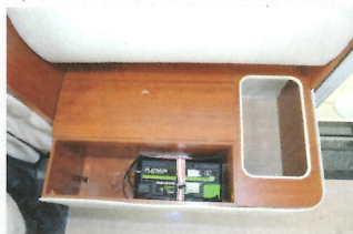
Storage under the side sofa includes space for the battery