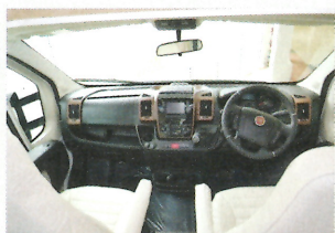
The Fiat cab has DAB stereo and a reversing camera

The floor cubbyhole for footwear (one of four), pouch