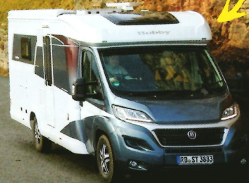
Hobby Optima T70F Deluxe at the Great Orme, Llandudno