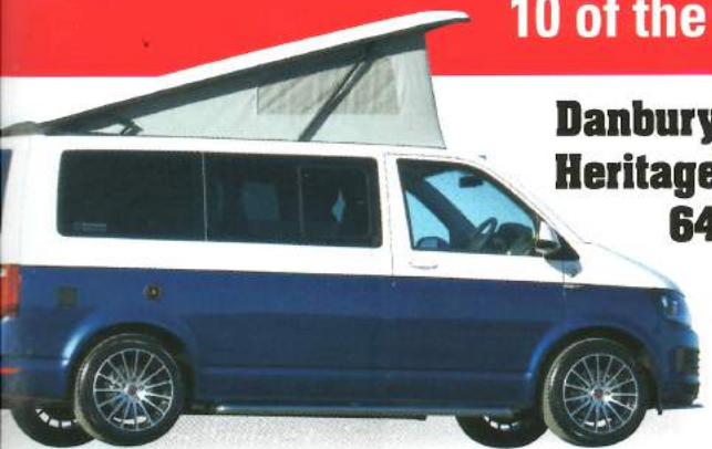
Danbury Heritage 64

10 of the very latest campervans and motorhomes