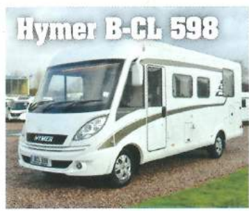
Hymer B-CL 598