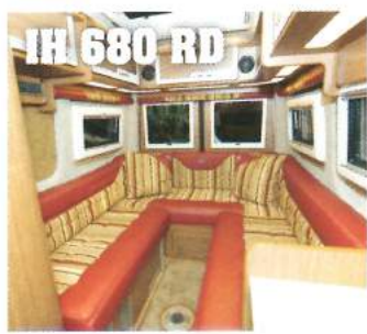
IH 680 RD