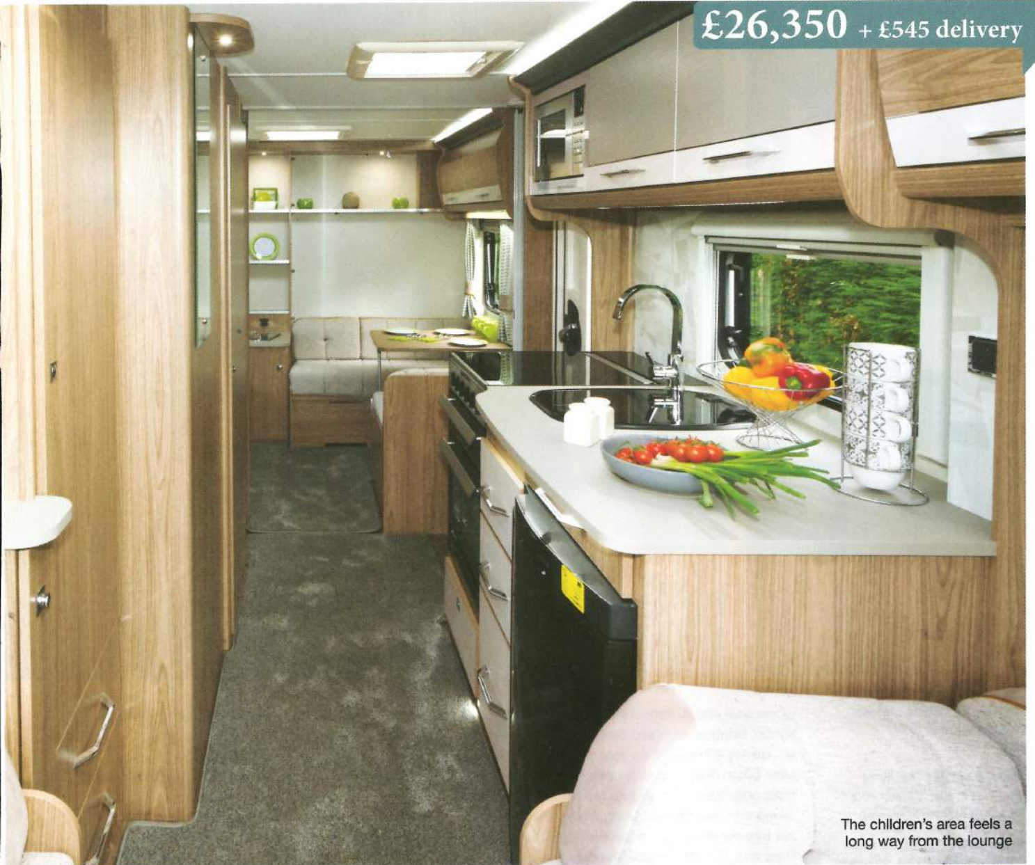
The children's area feels a long way from the lounge

parents aren't particularly tall, they have the option to use the lounge as single beds – or enjoy the luxury of a large double bed.