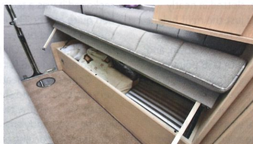
The hob has an oven/grill; the nearside seat base offers storage