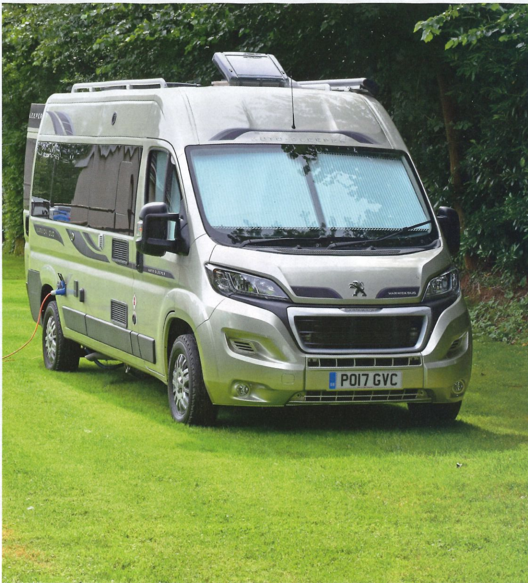
The Duo looked good on our grass pitch at Moorhampton, one of our favourite sites, and passers-by weren't slow to let us know it!

→ set up by pulling out the two seat base frames to create the bed base – all easy to do, and completed in less than a minute.