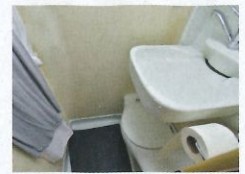
The washroom is inevitably small, with a basic shower, flush loo and tip-up basin

Washroom The side washroom is as you go in ★★★★★ by the main sliding entry door. It's understandably small. You can shower in it, but we used site facilities instead. It has a fixed electric flush cassette loo below a small moulded vanity unit with a tip-up sink. The LED light is bright, and although no window is fitted, a roof vent allows in natural light and adds to the air flow. The washroom is not fully lined, so it isn't as easy to wipe down as a fully lined unit.