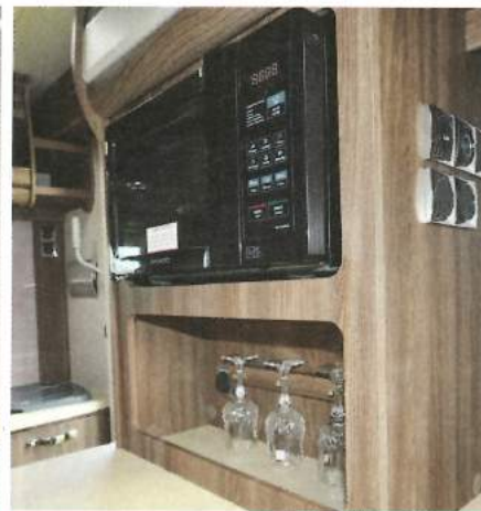
Clockwise from left: good use of space in the kitchen; microwave is set at a sensible height; decent equipment levels in the Mercedes cab