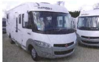
RAPIDO 8066DF From £67,700 OTR ★★★★★