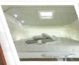
Drop down beds