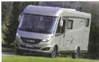
HYMER B DL 588 From £82,440 OTR ★★★★★