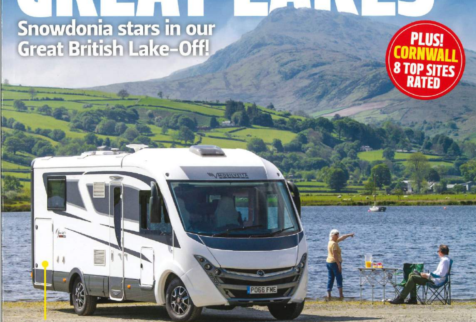
Mobilvetta K-Yacht: A-class flair from Italy! Full live-in test, p70