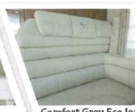
Comfort Grey Eco leather upholstery