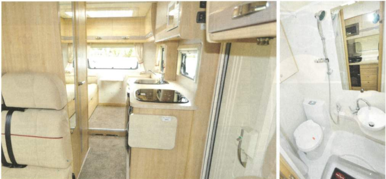
Clockwise from above: kitchen features drop-down extension; adequate washroom; drop-down double is the most comfortable; lounging options are varied; useful microwave