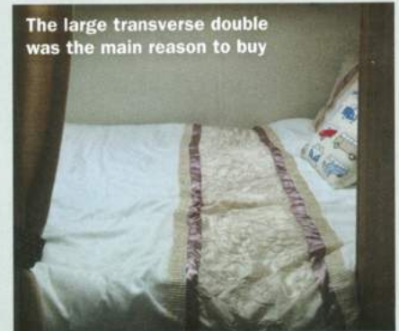
The large transverse double was the main reason to buy