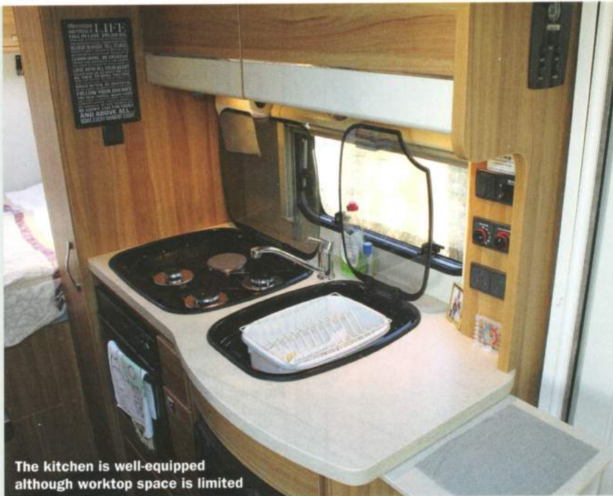
The kitchen is well-equipped although worktop space is limited