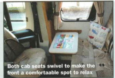
Both cab seats swivel to make the front a comfortable spot to relax