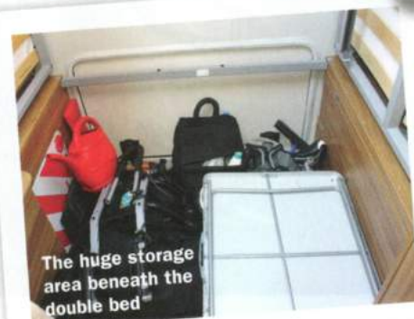
The huge storage area beneath the double bed

If we were planning to change we would go for a large campervan with sliding door and a long-enough fixed bed