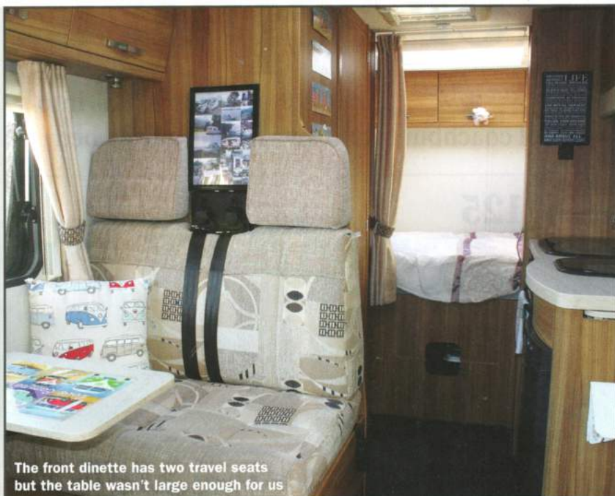
The front dinette has two travel seats but the table wasn't large enough for us

We always take bikes but did not choose to add a bike rack – it would deny access to the rear storage hatch and the 'van had already had a towbar so we use our towbar-mounted rack.