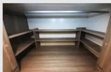
Huge double wardrobe provides masses of useful shelf space