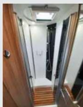
Headroom in shower is good, and the area feels bright and airy