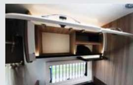
Overhead lockers in the kitchen should be big enough for dry goods