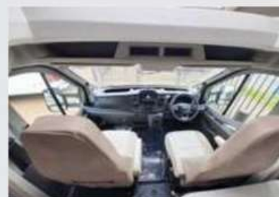
Standard Ford cab interior with drinks holders in the corners

... which is big enough to store a bike without folding it up