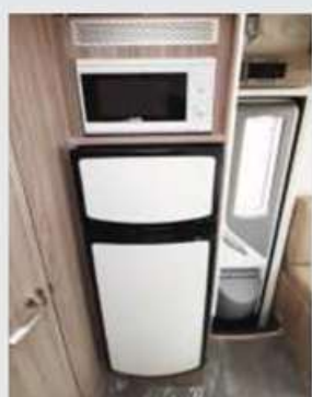
145-litre AES fridge has a separate freezer, and microwave is just above