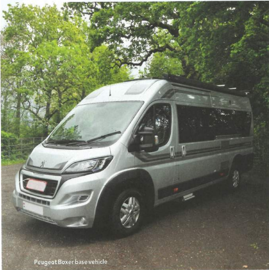
Peugeot Boxer base vehicle