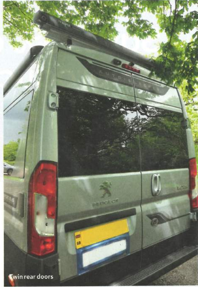
Twin rear doors