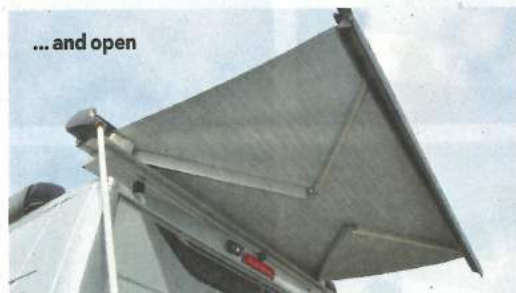
... and open