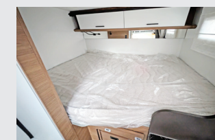
Transverse bed has a headboard, two spotlights and air conditioning