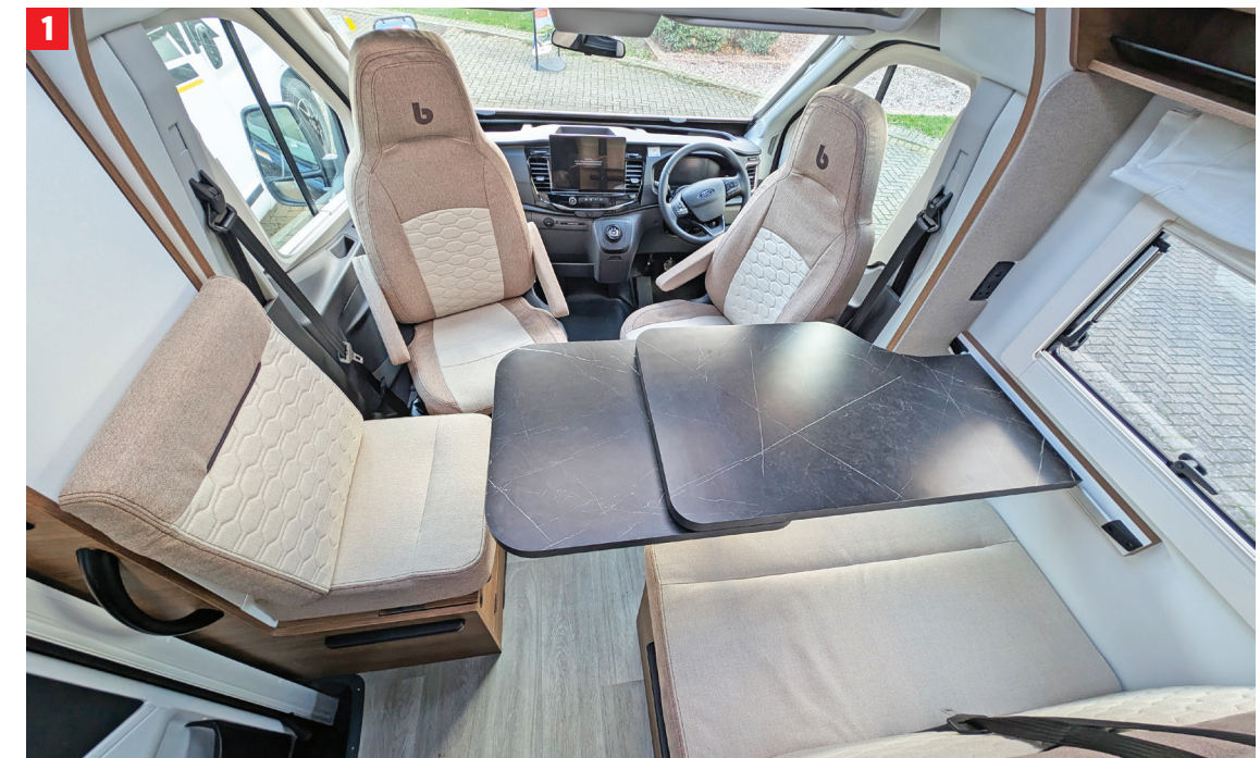
1 Front dinette is flooded with light and there's plenty of room for dining

The bed that you make up from the seats in the front lounge is less