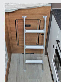
LEFT There's a ladder to the transverse bed at the rear of the 'van...