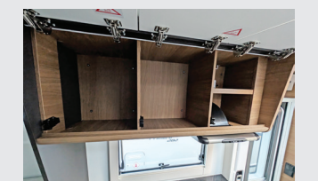
Three big lockers above the kitchen are ideal for storing your dry goods