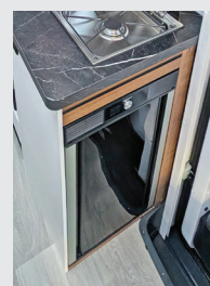
Half-height fridge is fine for a couple and is easy to access from inside or out