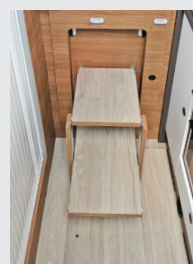
RIGHT ... or you can use the fold-out steps to get there