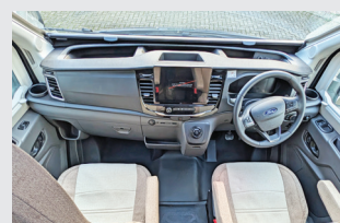
The Freedom Drive pack includes a 12-inch Ford touch-screen radio