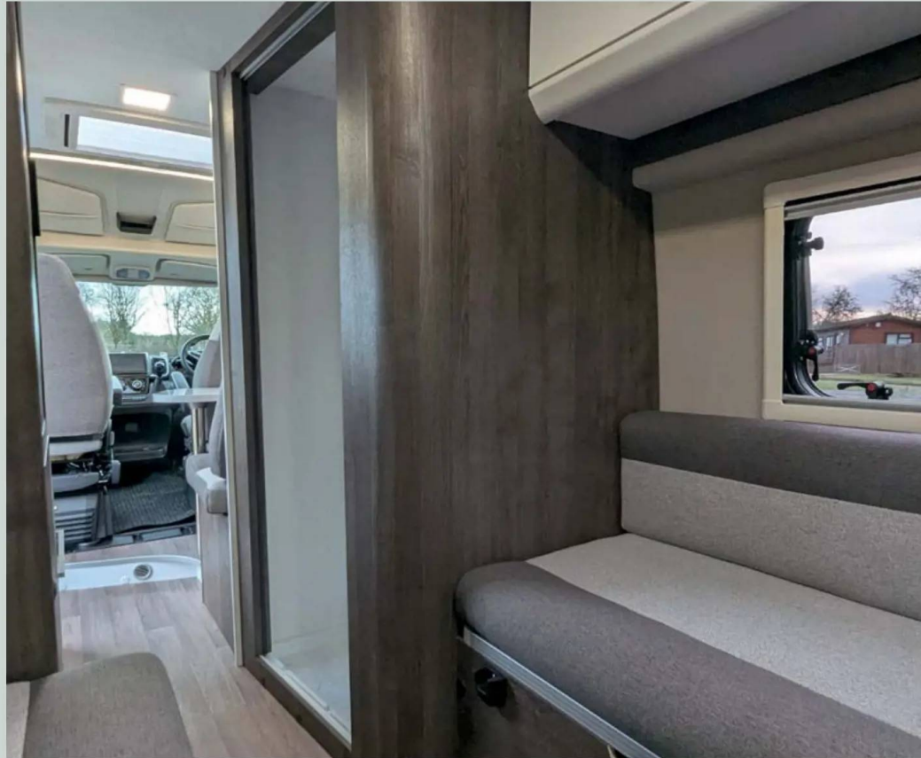
The washroom sits opposite the kitchen, behind a sliding tambour door

there aren't a few flashy touches – the 16in alloy wheels, for example. The height of around 2.65m allows comfortable standing room inside without feeling overly tall on the road, although, of course, it does rule out access to many car parks.