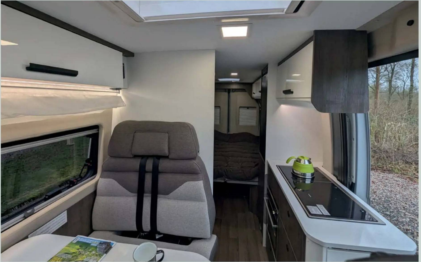
The front dinette area includes two belted travel seats for with Isofix for child-friendly travel

and, as with most campervans, compromise is inevitable, but Benimar has made smart use of the available space. The all-important shower and riser rail sits to the left and there's a towel rail and shower tray, too. On the right is a space-saving foldaway basin and a 12V flushing loo that can be swivelled to give you more space to move. There's a storage shelf in there, too, for your washroom essentials and a small window with flyscreen.