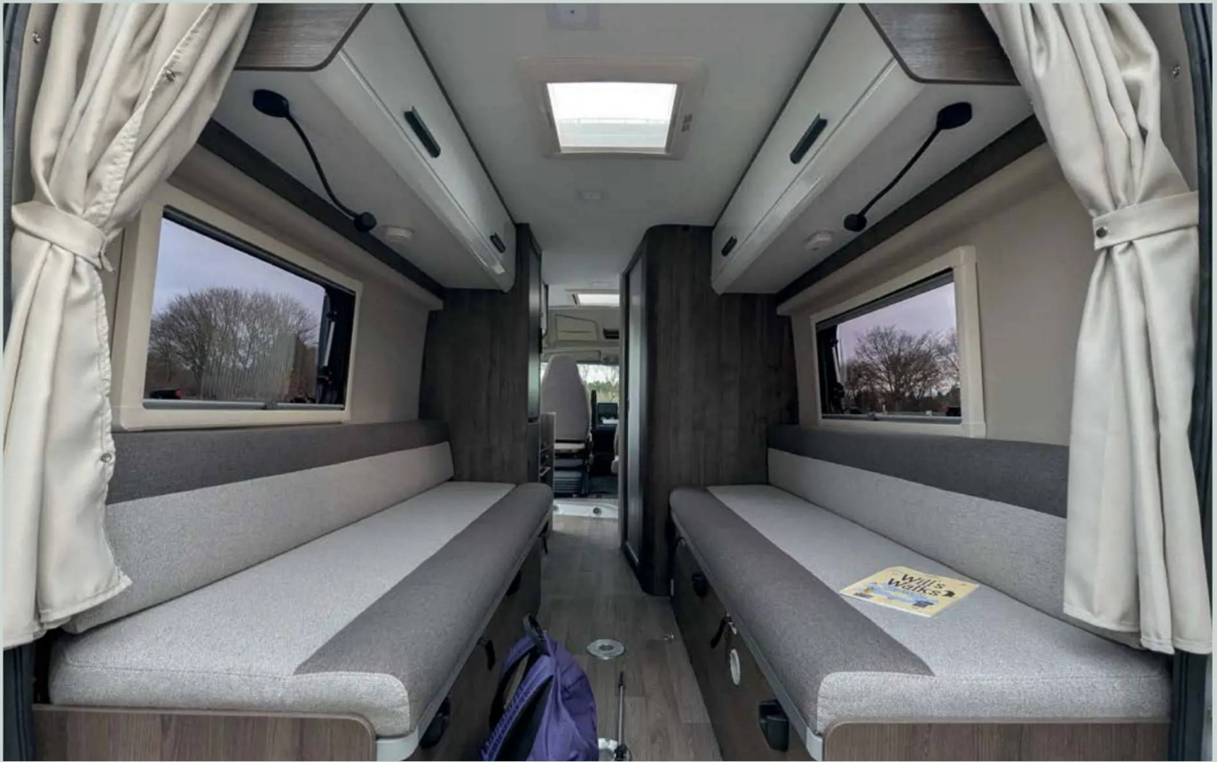
View of the rear lounge from the rear doors. The dining table can be used in here

The campervan market is awash with 'vans promising adventure. Some lean heavily into rugged imagery, others focus on luxury touches. The Benimar Benivan 122 takes a more level-headed approach. It's a 'van designed for real people rather than glossy brochures – couples or solo travellers who want dependable comfort, practicality and sensible pricing without feeling short-changed on specification.