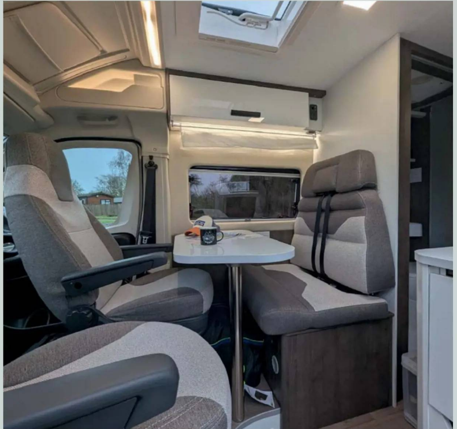
The comfortable front lounge

equipment, with four eyelets on the floor in the rear lounge to keep items lashed down while driving. Or, if you just enjoy getting away and relaxing, it's comfortable enough for that, too.