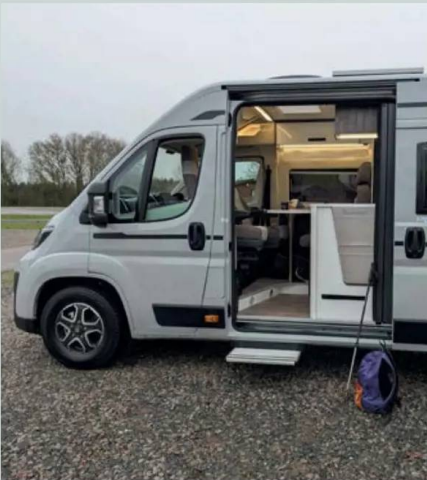
The side door with flyscreen and electric step