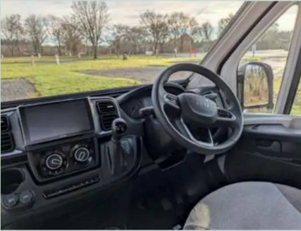
The 9in touchscreen with reversing camera