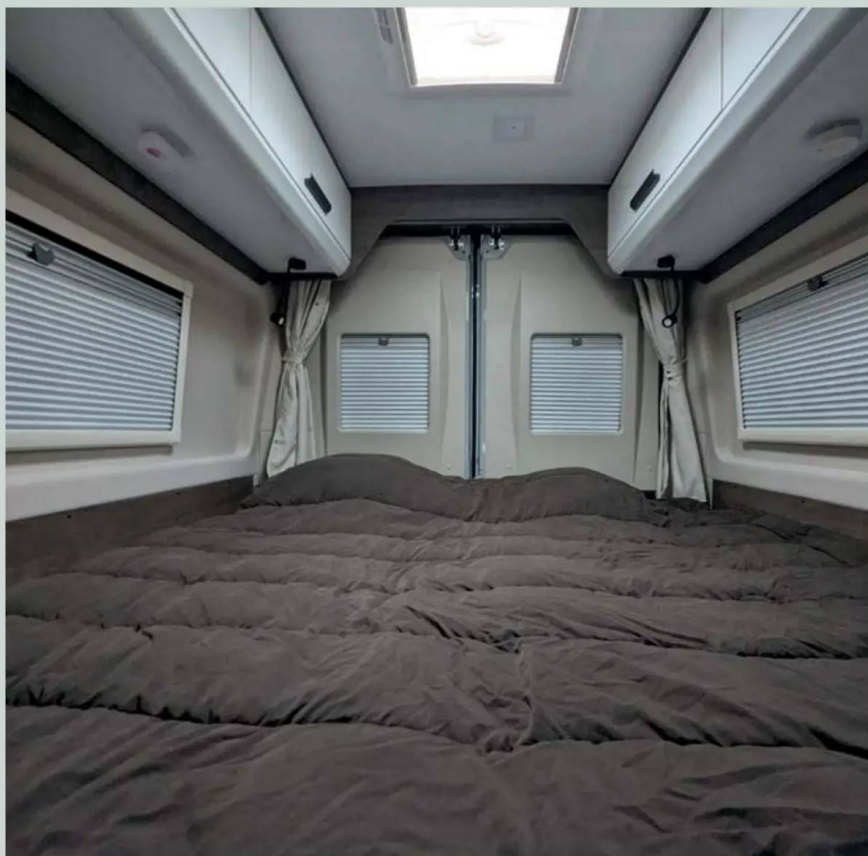
The lounge quickly converts to a double bedroom