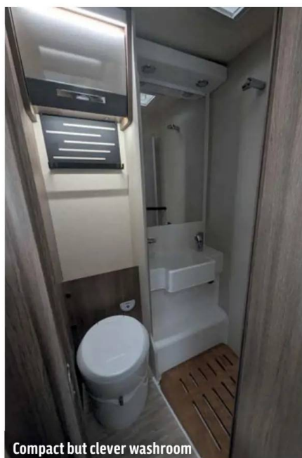
Compact but clever washroom