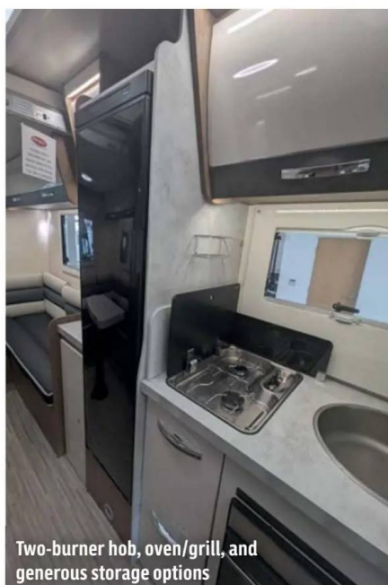
Two-burner hob, oven/grill, and generous storage options

There are brand-new models available at dealers right now, with a range of pre-registered motorhomes available for a limited time. MMM