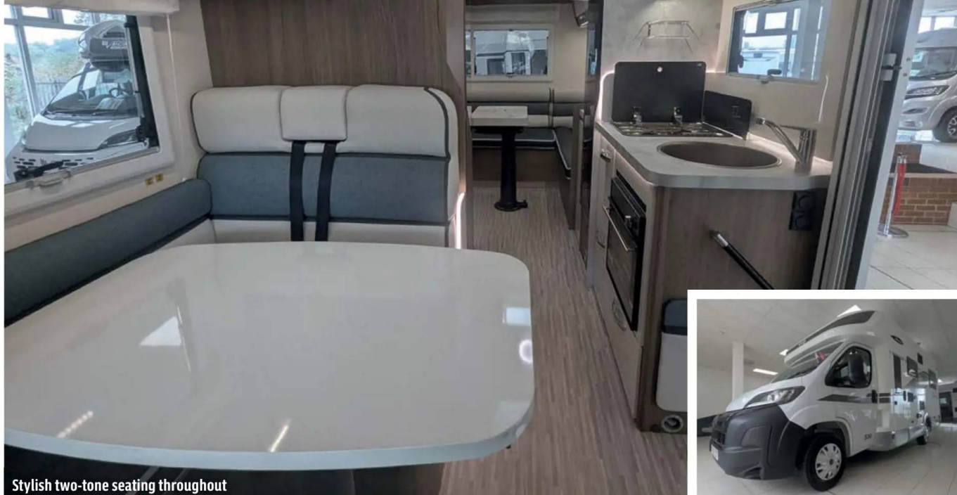
Stylish two-tone seating throughout

Compact Italian motorhome packs big features into a 6.5m frame