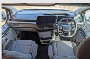
Ford's great new cab provides a huge infotainment screen