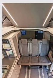
LEFT Three belted travel seats, and there's the option for two more