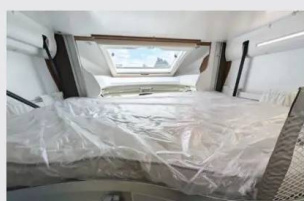
Left Ladder to drop-down bed butts up against the fridge when in use...

Left ... but it's a very bright and airy space above