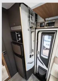
Fridge has a separate freezer, and microwave is located above