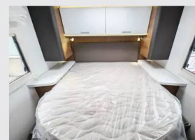
Rear island bed has a sizeable headboard and bedside tables