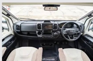
Standard Fiat Ducato cab with 140bhp engine and six-speed manual gearbox