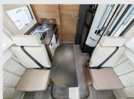
Two travel seats in the rear can accommodate adults in comfort