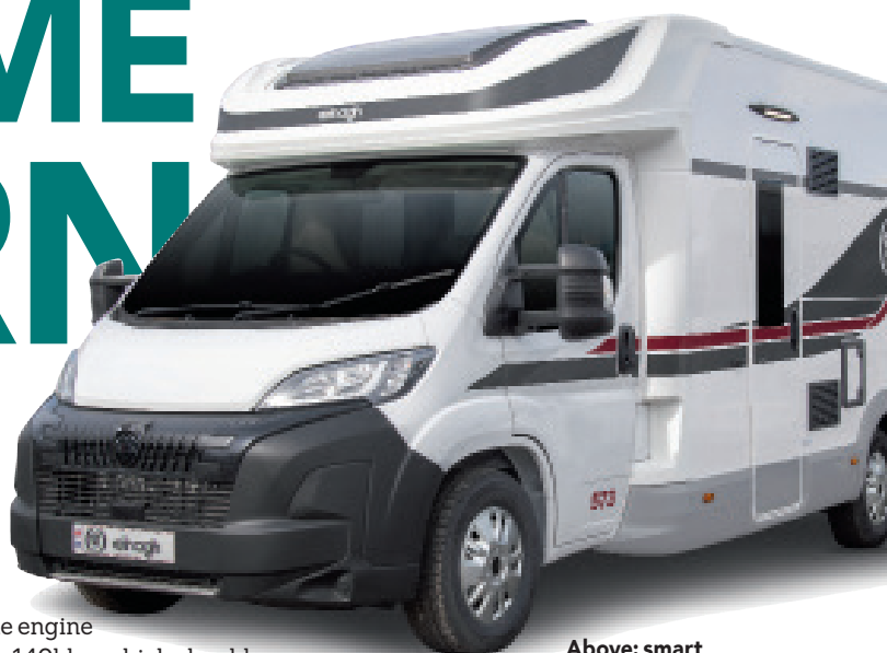
Above: smart bodywork is all-GRP

Italy's Elnagh returns to the UK market with a four-model range. Nick Harding is impressed by the value for money on offer