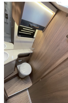
Shower room and washroom straddle the corridor