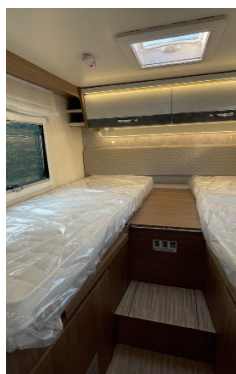
Single beds can be converted into a double

and further storage on the offside. There's also a small rooflight overhead as well as windows each side. Reading lights on stalks have USB portals in their bases, and the open shelves in each corner are ideal for books, spectacles, glasses of water and more at night-time.