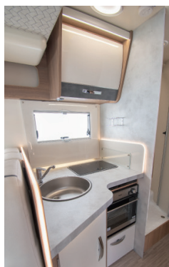
Neat kitchen features two-ring hob

Vehicle supplied for testing by: Marquis Leisure Berkshire, Oxford Road, Chieveley, Nr Newbury, Berkshire RG20 8RU Contact: marquisleisure.co.uk, 01635 248 888