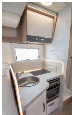
Neat kitchen features two-ring hob