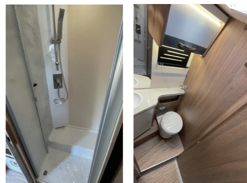
Shower room and washroom straddle the corridor

Everything you need is here, from the Truma Combi 6E hot water and blown air heating to 100l fresh and waste water tanks. You'll find plenty of ceiling and ambient strip lighting and central locking that includes the habitation door. You might appreciate the lower-set gas locker when it comes to getting cylinders in and out. Ditto for the easy-pull dump valve for the waste water.