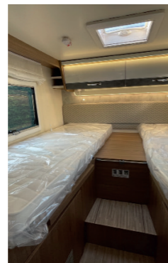
Single beds can be converted into a double

and further storage on the offside. There's also a small rooflight overhead as well as windows each side. Reading lights on stalks have USB portals in their bases, and the open shelves in each corner are ideal for books, spectacles, glasses of water and more at night-time.