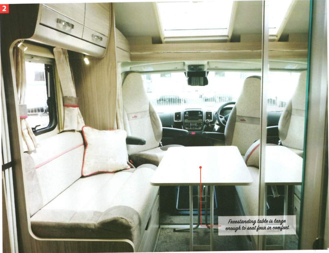
Freestanding table is large enough to seat four in comfort.

The special Majestic features in this 'van include bespoke ActivCare upholstery – smart cream-and-grey cushions with red piping that look very stylish, while matching curtains and bolster cushions complete the look (2).