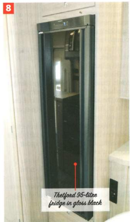
Thetford 95-litre fridge in gloss black