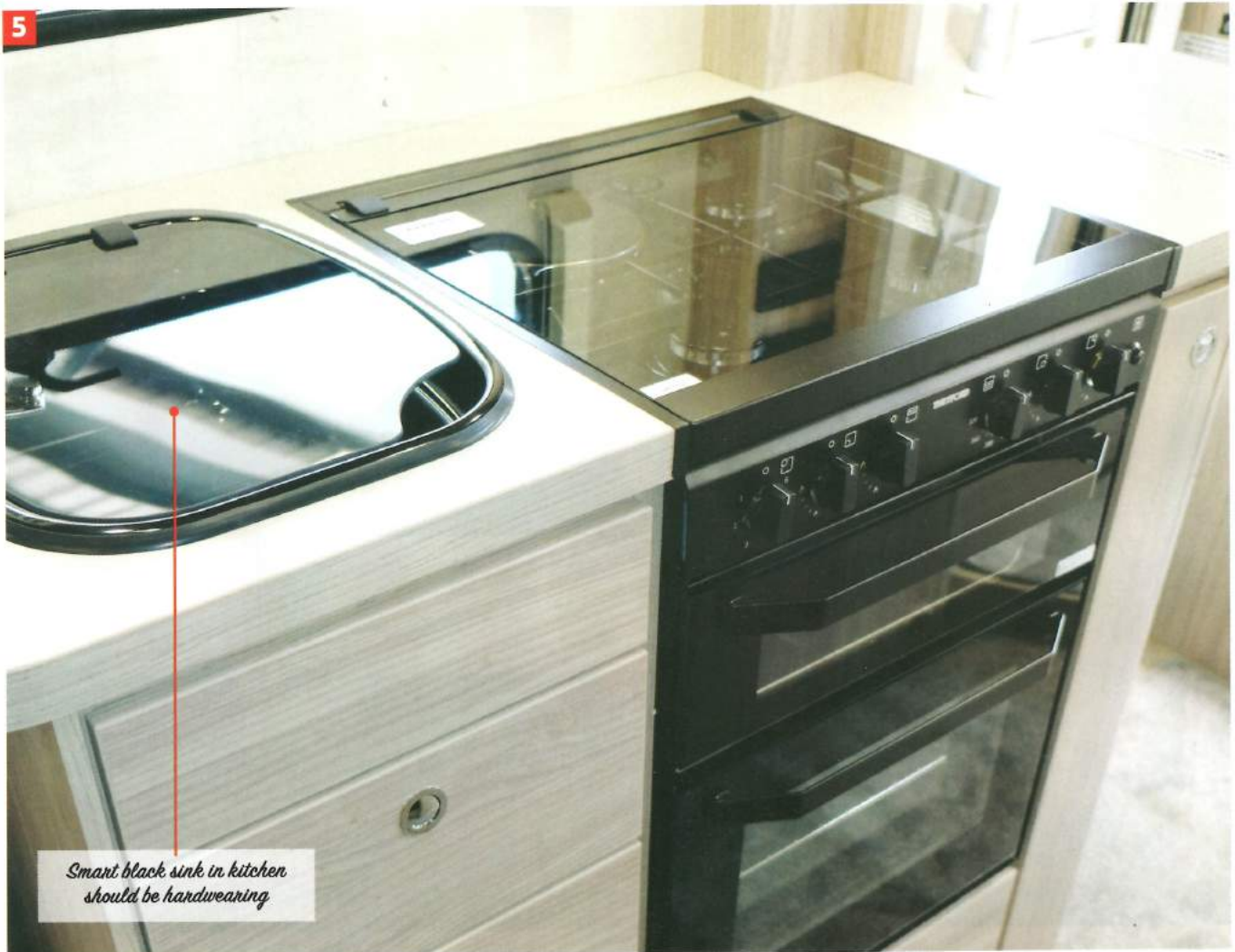
Smart black sink in kitchen should be handwearing

The kitchen is located to the right of the accommodation door as you step in, and is smartly designed and equipped, with attractive cream work surfaces (5).