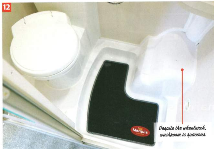
Despite the wheelarch, washroom is spacious

There is a blown-air heating vent in here, though, to help keep things warm, and a small rooflight above for ventilation. Illumination is also good, thanks to the pair of spotlights. ➔