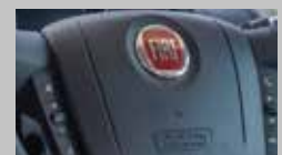
Driver & Passenger Air Bags

*Eco Synthetic leather is made of 50% Polyester, 30% Cotton and 20% Regenerated Leather.