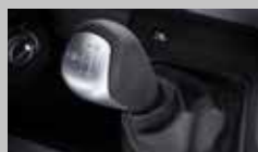
Automatic Gearbox Option