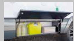
Side Skirt Storage