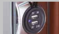
USB Charging Sockets