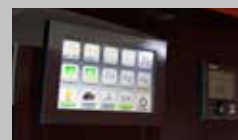
Touchscreen Control Panel