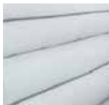
Comfort Grey Eco Synthetic Leather* (K-Yacht)