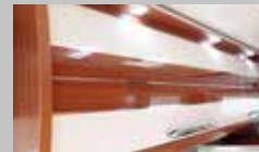
"Marine" Style Furniture