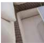
Moby Eco Synthetic Leather* (Kea P)